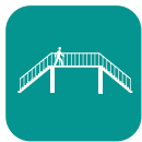
Pedestrian Bridge Decks