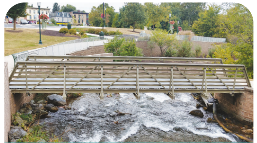
ASSET FRP ACCESS BRIDGE