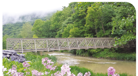
ASSET FRP ACCESS BRIDGE